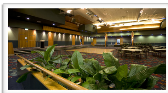
Main function room (Function 1)

The Events Complex features technologically advanced facilities including the latest in audio visual presentation equipment and AMX touch screen technology. The sound and lighting systems are suitable for the most extravagant event and are certain to astonish both you and your guests.